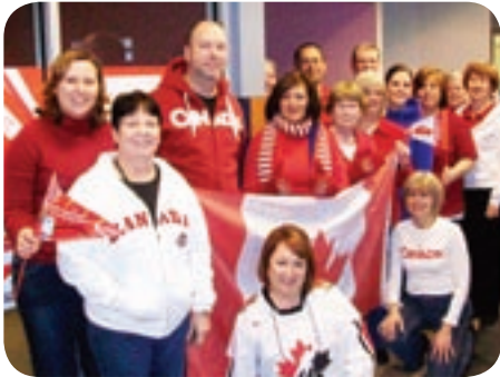
Our staff showed their Olympic support and Canadian pride during the Winter Olympics.

Essex Kent Boys Junior Golf Tournament Calloway in School Program We Care for Kids Goodfellows Downtown Mission Salvation Army International Women's Day Make A Wish Foundation Hiatus House Alzheimers Society Hotel Dieu Grace Hospital Youth sports organizations Big Brothers & Big Sisters Windsor and District Soccer League Victim Services Girls & Boys Baseball & Hockey In Honour of the Ones We Love Unemployed Help Centre Windsor Essex County Senior Sports Organization