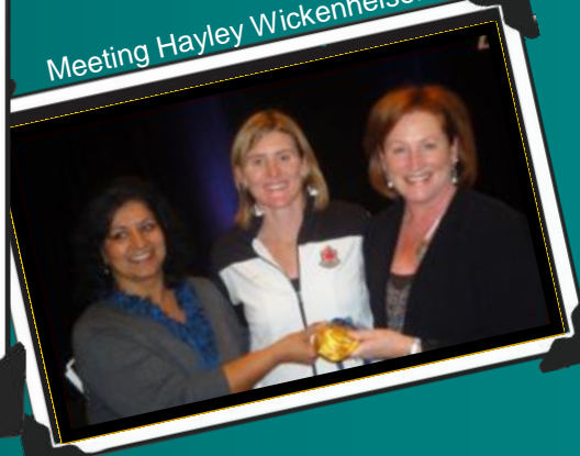
Meeting Hayley Wickenheiser...