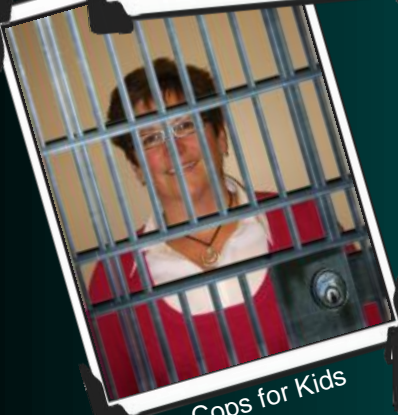
Cops for Kids